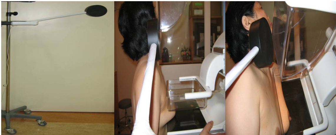
Fig. 1. The method of the scattering dose of thyroid.

damaged by radiation because of its proximity to the breast and that it is affected by estrogen. There are many reports showing that breast cancer is related to thyroid gland diseases [4-7], nodular hyperplasia, hyperthyroidism and thyroid cancer. In other words, women with breast cancer generally have a disease of the thyroid gland [8,9]. Radiation from a mammography examination can damage the thyroid gland. The aim of this study was to determine the effect of an average glandular dose by mammography on the thyroid gland.